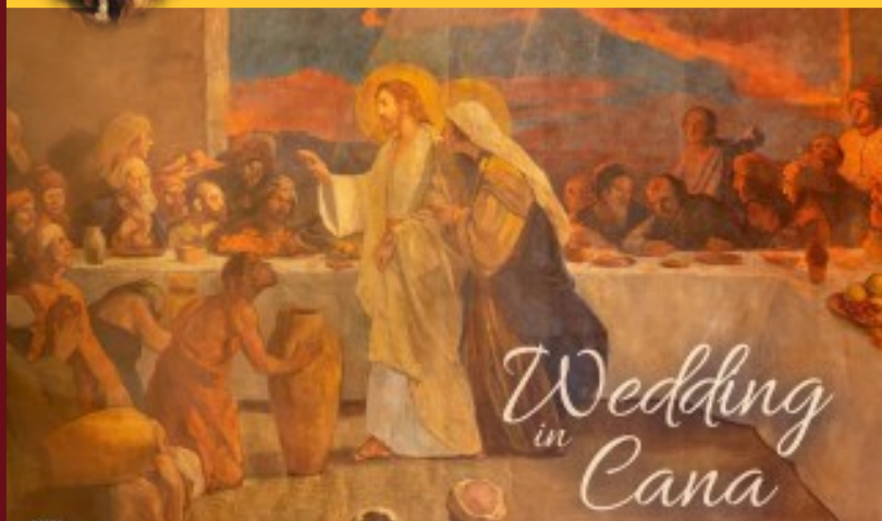
Wedding in Cana