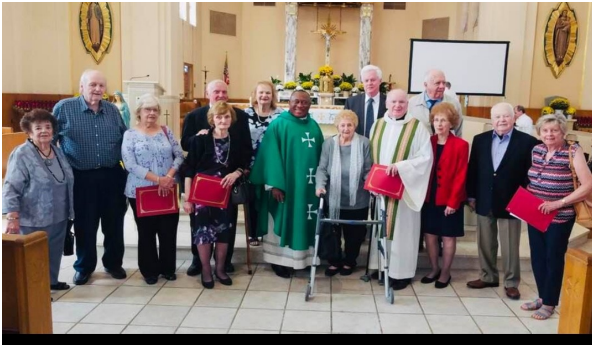
Long time parishioners (60 years and over) Honorees September 29th—St. Michael's Feast Day. 12:00 Noon Mass